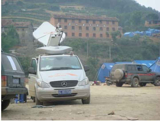
SNG vehicle with ND SatCom SkyRAY Compact antenna subsystem