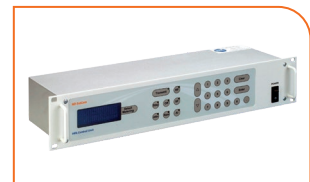
REMOTE CONTROLLER E200