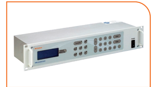
REMOTE CONTROLLER E200