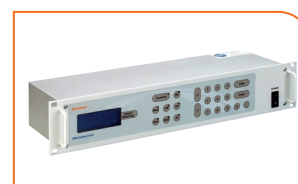
REMOTE CONTROLLER E200