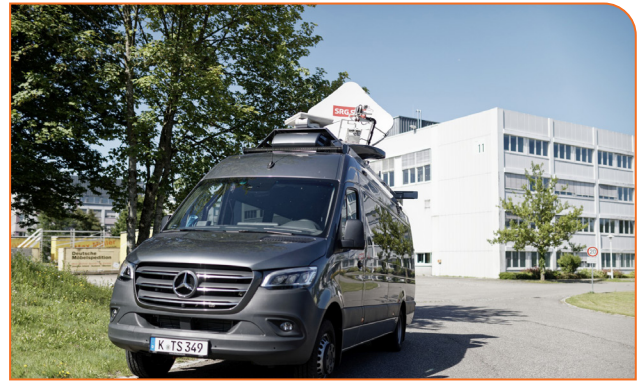
TOPSHOT SNG – ONE CLICK SETUP AND LIVE FEED

The operator transmits video over IP (mobile network + OuFlex) and DVB. DVB was chosen to always have the possibility to be on air because there were many situations in the past where it was the only way to transmit. Customers want to focus on video production and want uplink setup to be as easy as possible. The One Button Solution gives customers the possibility to do exactly that: with one click, they are ready to broadcast via satellite without being familiar with the entire system.